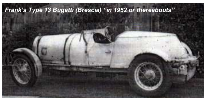
Frank's Type 13 Bugatti (Brescia) "in 1952 or thereabouts"