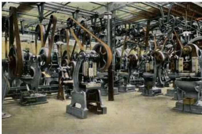
"Pressed steel department, where small parts are made." Postcards showing the Ford plant in 1917.