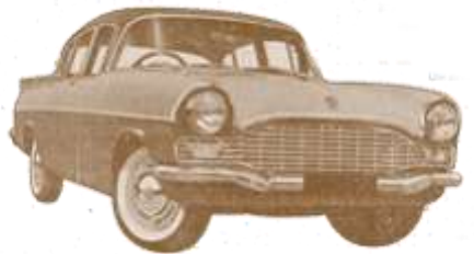
1961 Vauxhall Cresta